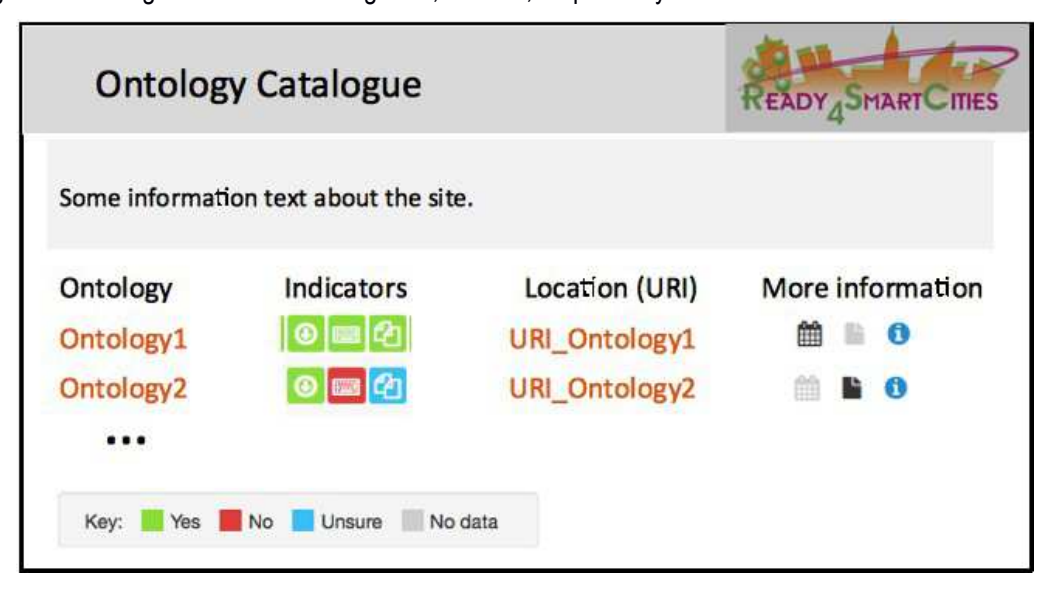
Figure 2. Ontology catalogue web interface prototype

The catalogues in the RDF format will be published in RDF files on a web server. In addition, a web page will show the catalogues in a human-readable way. A preliminary prototype of the web pages of the ontology, dataset and alignment catalogues are shown in Figure 2, 3 and 4, respectively