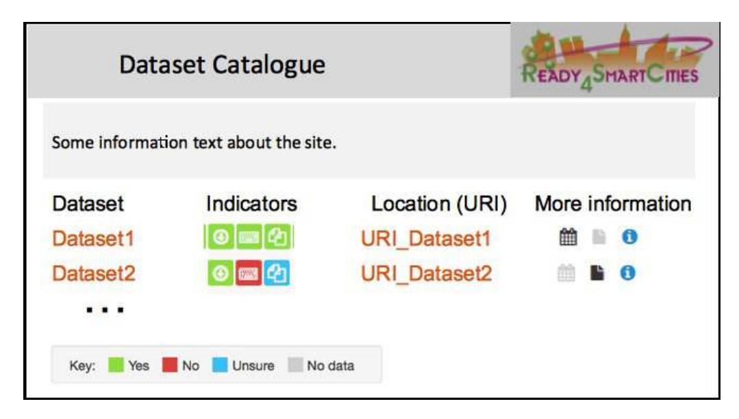
Figure 3. Dataset catalogue web interface prototype