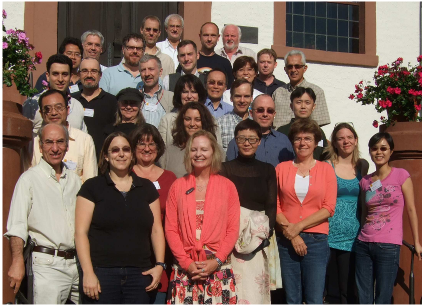
■ Figure 1 Group picture of all participants taken in the sun outside the Dagstuhl chapel.