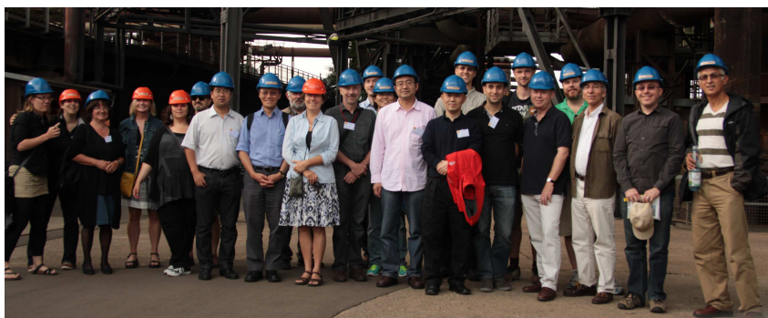
■ Figure 3 Excursion to Völklinger Hütte allowed for less structured research conversations and an interesting lesson about the ironworks.