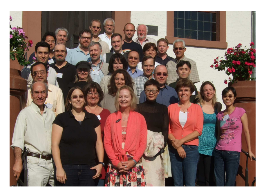
Figure 1 Group picture of all participants taken in the sun outside the Dagstuhl chapel.