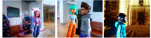
Figure 3: System in action in various environments (see also on http://youtu.be/hnmqMc3hZgM )

The system has been tested on both Android and iOS. The mobile phones were Samsung Galaxy S2, Samsung Galaxy S3 and iPhone 4S. On both the Galaxy S3 and the iPhone 4S (which are not current high-end mobile phone) the tracking and image-based re-localization are done in real-time for an image of sizes, respectively 320x240 and 480x360. A descriptor based re-localization lasts between 800ms and 1500ms when it's a success. The framerate on the Samsung GS2 is near real-time, and can only really be used with the image-based re-localization. The descriptor-based re-localization increases the spatial coverage by a factor three.