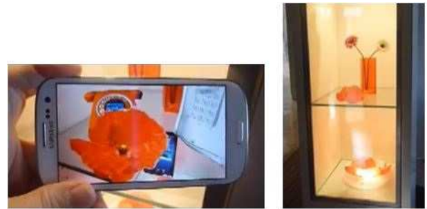
Figure 1: Augmentation of a store front. On the left the live representation of the augmentations (tablet, orange phone, white phone). On the right the real environment (see also video).

The proposed system takes the form of an application suite, where three roles intervene: the map-maker, the designer and the end-user. To explicit further each role, we take the example of the augmentation of a store front (Fig. 1). One basic application idea is to allow a user/consumer to interact with a store even when it is closed.