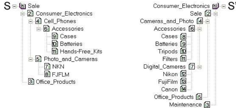
Fig. 1. Two XML schemas

query expressions that automatically translate data instances of these schemas under an integrated schema.