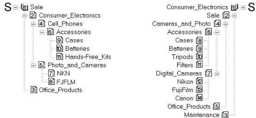
Fig. 1. Two XML schemas

query expressions that automatically translate data instances of these schemas under an integrated schema.