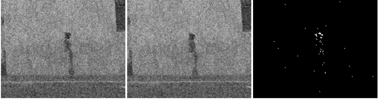
Figure 8. Two consecutive images ( 180 \times 144 ) perturbed by a Gaussian noise (standard deviation equal to 30), and the corresponding thresholded difference image.