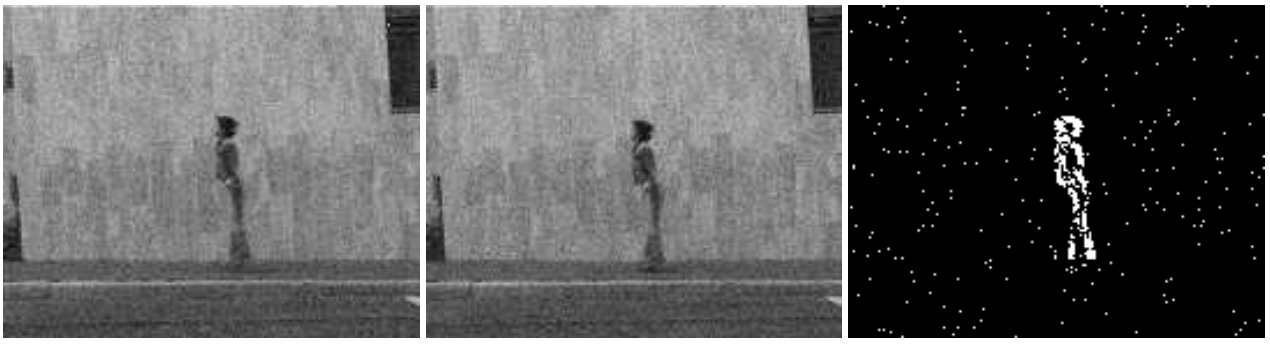
Figure 7. Two consecutive images ( 180 \times 144 ) perturbed by a Gaussian noise (standard deviation equal to 10), and the corresponding thresholded difference image.