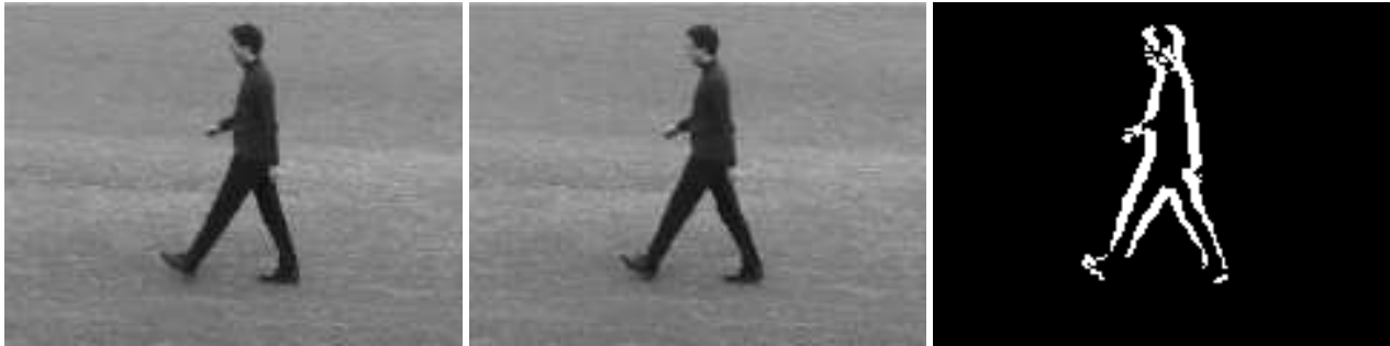
Figure 4. Two consecutive images ( 160 \times 120 ) taken from an image sequence, and the corresponding thresholded difference image.