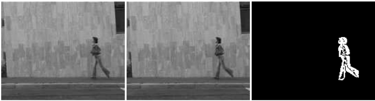
Figure 3. Two consecutive images ( 180 \times 144 ) taken from an image sequence, and the corresponding thresholded difference image.