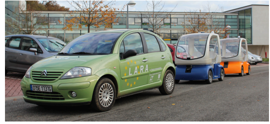
Fig. 3. Three vehicles platoon demonstration supported by video streaming safety application

1) Multi object detection and tracking in 5 steps: In the Data processing step (1), distances coming from the front and rear laser sensors are converted into (x, y, z) points in