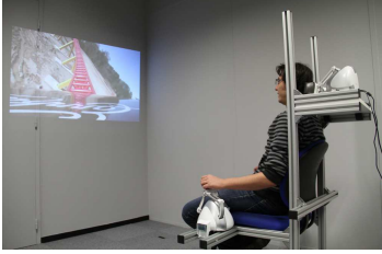
Figure 3: The user, comfortably installed on our device, is experiencing passive navigation enhanced by a haptic effect of motion.

Figure 3). The head actuator is equipped with a block of foam to ensure user's comfort.