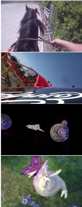
Figure 2: Screenshots of the videos (from top to bottom): Horse Riding, Rollercoaster, Spaceship and 4D Home Cinema.

(DoF) platform driven by 6 hydraulic cylinders [4] (see [8] for a typical example of a Stewart platform-based driving simulator). This technology, mainly used in virtual reality settings, is coming to entertainment applications through video games, amusement parks and “4D cinemas”. Besides, recent results show that haptics has a great potential for enhancing video viewing experience [1, 6]. We believe that the next step of this evolution would be the use of motion simulators in consumer environment. Though Stewart platform-based motion platforms provide a realistic sensation of motion they remain expensive for mass market and they are not suitable for consumer settings. Simpler setups based on force-feedback [7, 2] or vibrating devices [9] would be more adapted but they trigger only a limited sensation at the moment.