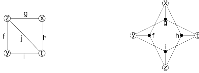
Figure 1: Graphical representations of the rules (2), of arity 4 and rank 2, and (3), of arity 4 and rank 3.