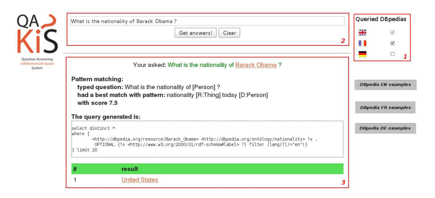
Fig. 3. QAKiS demo interface

NER), i.e. French or German DBpedia (box 1). Then the user can either write a question or select among a list of examples, and click on Get Answers! (box 2). As output, QAKiS provides: i) the user question (the recognized NE is linked to its DBpedia page), ii) the generated typed question, iii) the pattern matched, iv) the SPARQL query sent to the DBpedia SPARQL endpoint, and v) the answer (box 3). The demo we will present follows these stages for a variety of queries.