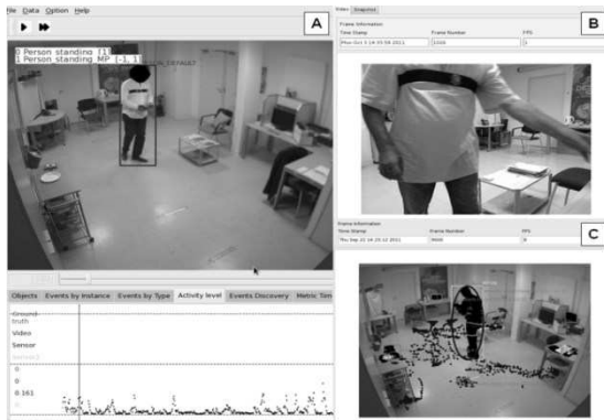
Figure 8. Participant' activity by the view point of different sensors: (A) RGB camera view and actimetry provided the inertial sensor (the bottom of image A); (B) RGB-D camera view of participant, which shows the inertial sensor worn by the participant; and (C) Drawn points on the ground represent the trajectory information of the participant during the experimentation.

Figure 8 shows the recording viewpoint of the RGB and RGB-D cameras in A and B, where WI sensor is visible at image B.