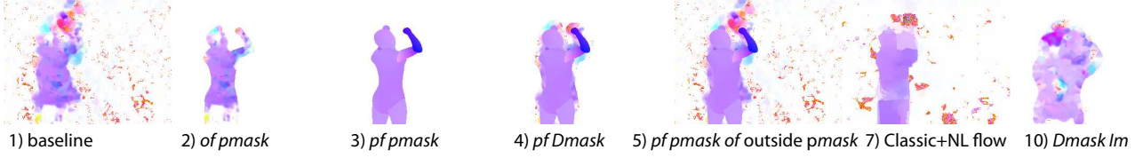
Figure 2. Comparison of various flow settings. The flow is numbered according to Tab. 2. See Sec. 4.2 and Sec. 5 for details.

method on the HMDB51 database [14] and because it relies on video feature descriptors that are also used by other methods. We first review DT in Sec. 4.1, and then we replace pieces of the algorithm with the ground truth data to provide low, mid, and high level information in Sec. 4.2, Sec. 5 and Sec. 6.2 respectively.