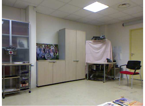
Fig. 4. Room where the patients evaluations take place.