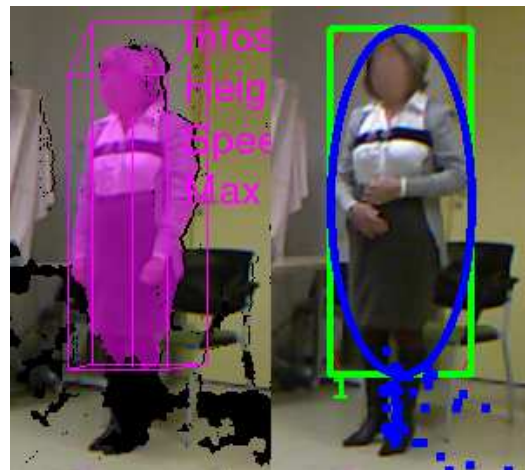
Fig. 2. Black clothes consequences example. This figure shows the consequences of the absorption of the infrared rays by the black clothes on the quality of the person's detection.

Height Computation. In some cases, infrared rays are absorbed when the tracked person is wearing black clothes. The consequence is that some parts of the body (generally