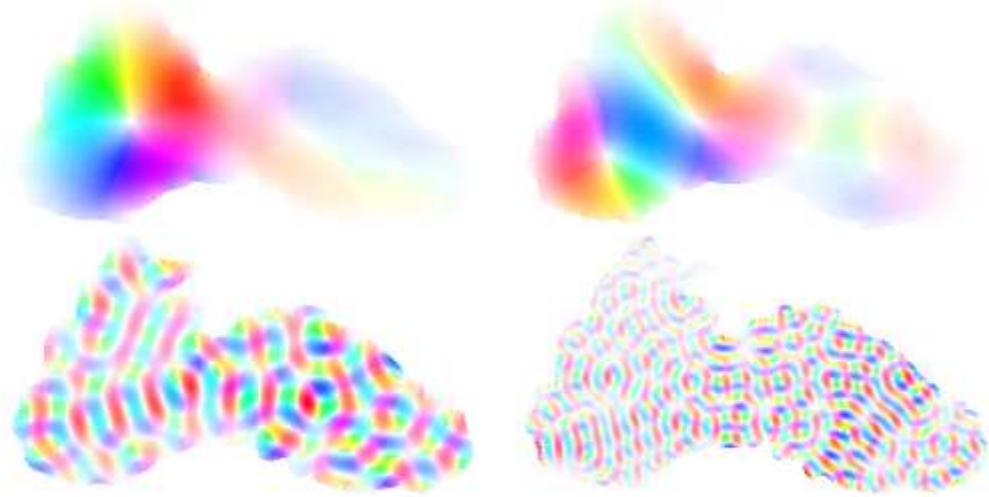
Figure 1 Elements 1, 4, 128 and 512 of the divergence-free motion basis

and \mathfrak{F}_B denotes the subspace of \mathfrak{F} of divergence-free motion with null normal value on the boundary of BS . Some \phi_i elements obtained from that minimization issue are given in Figure 1 for i = 1, 4, 128 and 512 . Scales modeled by these basis elements are finer as i value is increasing. The image basis \Psi is obtained in the same way.