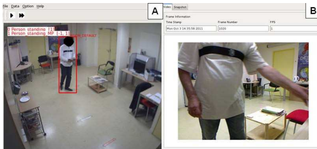
Figure 5. Scene point of the view in respect to the 2D RGB (A) and RGB-D (B) cameras.

The 2D RGB camera records video data from the top of one of the corners of the experimentation room, while the RGB-D camera records them from a lateral view of the scene. The lateral view is chosen as this camera placement on a position similar to the RGB camera would decrease its system performance on people detection. The decrease is due to the depth measurement become less reliable when the person moves farther than 4-5 m of the camera ( e.g. , on events at the back of the room). Figure 5 illustrates the differences in point of view of both cameras. The second part of the evaluation focuses on the evaluation of mid-term duration activities (IADLs).