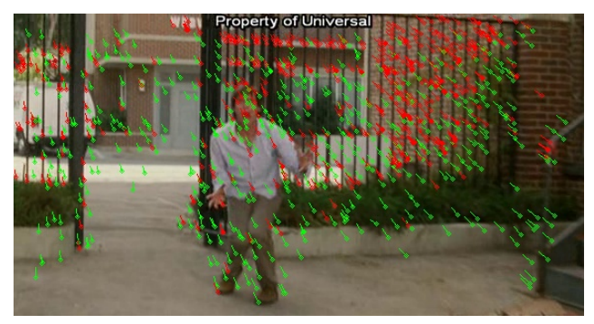
Figure 2. Visualization of inlier matches of the robustly estimated homography. Green arrows correspond to SURF descriptor matches, and red ones to dense optical flow.

vant trajectories in the background in realistic videos. We can prune them and only keep trajectories from humans or objects of interest, if we know the camera motion (see Figure 1). Furthermore, given the camera motion, we can correct the optical flow, so that the motion vectors of human actors are independent of camera motion. This improves the performance of motion descriptors based on optical flow, i.e. , HOF (histograms of optical flow) and MBH. We illustrate the difference between the original and corrected optical flow in the middle two rows of Figure 1.