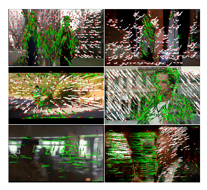
Figure 3. Examples of removed trajectories under various camera motions, e.g. , pan, zoom, tilt. White trajectories are considered due to camera motion. The red dots are the trajectory positions in the current frame. The last row shows two failure cases. The left one is due to severe motion blur. The right one fits the homography to the moving humans as they dominate the frame.

The rest of the paper is organized as follows. In section 2, we detail our approach for camera motion estimation and discuss how to remove inconsistent matches due to humans. Experimental setup and evaluation protocols are explained in section 3 and experimental results in section 4. The code to compute improved trajectories and descriptors is available online. <sup>1</sup>