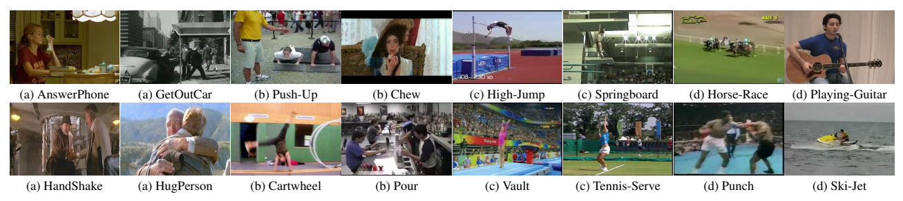
Figure 5. From left to right, example frames from (a) Hollywood2, (b) HMDB51, (c) Olympic Sports and (d) UCF50.

combined by summing their kernel matrices normalized by the average distance.