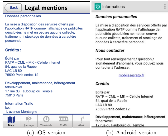
Fig. 1. In-App privacy policies of the iOS and Android RATP Apps.

The privacy policy (in French; See Figure 1) of RATP’s iOS App (version 5.4.1) claims: “ The services provided by the RATP application, like displaying geo-targeted ads, does not involve any collection, processing or storage of personal data ” (translated from the French version).