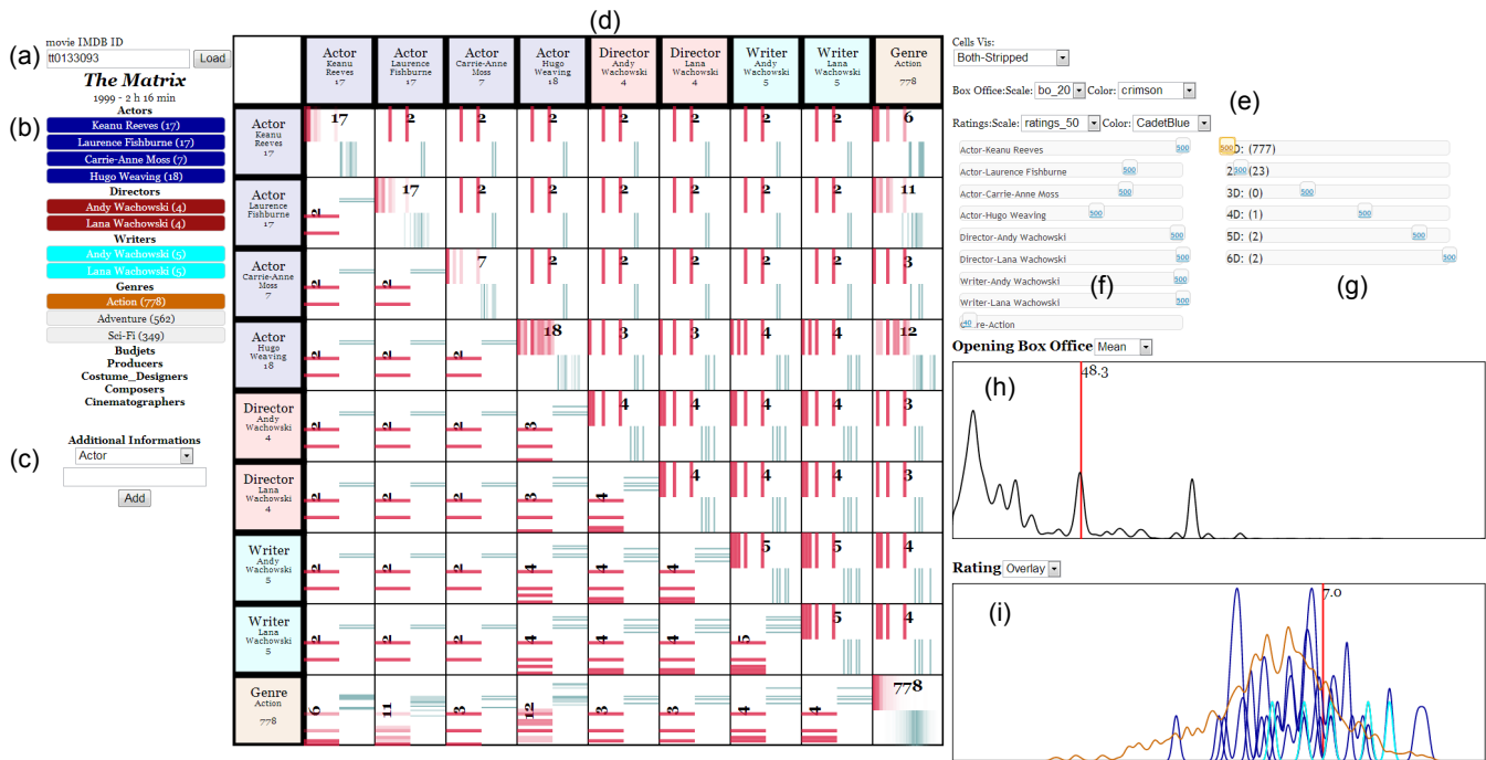
Fig. 2. CinemAviz interface: (a) Imdb unique ID input; (b) dimensions of the explored movie; (c) additional dimensions input; (d) matrix view; (e) matrix view visualization options; (f) sliders to weight each selected dimension; (g) sliders to weight movies according to the number of dimensions they have in common with the explored movie; (h) opening week box office prediction view; (i) user rating prediction view.

will often be stretched by dimensions with many movies. To give less importance to these dimensions, we visually weight the dimensions by observing the feedback in the views. Estimations are performed using the focus views, but going back and forth with the dimensions weighting step. Moving the mouse will trigger the inspector and display the value at the mouse position; the average value of the weighted dimensions is a vertical red line; brushing in the area makes a selection rectangle appear; and the average value within the brushed area is the vertical orange line at its center.