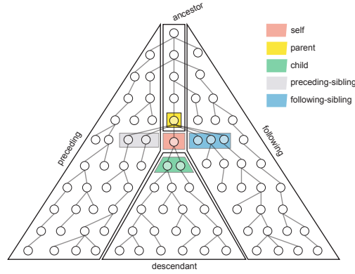
Fig. 5. Tree Navigation

We illustrate tree navigation in Figure 5. A very simple example of a combinator is the descendant relation that checks that a node satisfying some formula X is accessible in the subtree by any sequence of forward modalities. It is encoded as follows: