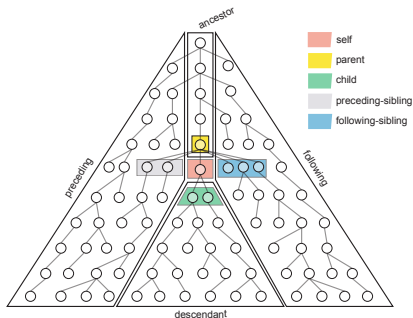
Fig. 4. Tree Navigation

We illustrate tree navigation in Figure 4. A very simple example of a combinator is the descendant relation that checks that a node satisfying some formula