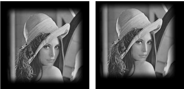
Figure 2: Unregistered images generated as in [10].

different translations in our experiments, produced by a generator of normally distributed random numbers with standard deviation equal to 10. The resulting numbers were rounded towards the nearest integers. The proposed iterative algorithm converged in all cases, but some re-initializations were needed. Note, in Fig. 1, where a correlation coefficient function along with its contour plot are shown for the case of window size 64 \times 64 , that the position of the first estimate lies in the main lobe.