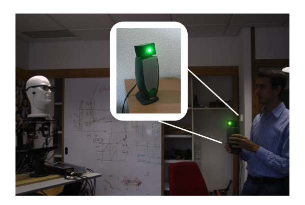
Fig. 2. Audio-visual device used to align the auditory and visual spaces. An LED light bulb is mounted onto a speaker which makes the visual localization more precise. White noise is played throughout the recording to improve the auditory localization.

The remainder of the paper is organized as follows. Section II describes the audio-visual alignment model. This leads to a maximum likelihood formulation and to an associated EM algorithm that is described in detail in Section III. Results obtained with simulated and real data are shown in Section IV. Section V concludes the paper along with a short discussion.