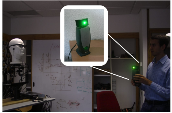
Fig. 2. Audio-visual device used to align the auditory and visual spaces. An LED light bulb is mounted onto a speaker which makes the visual localization more precise. White noise is played throughout the recording to improve the auditory localization.

The remainder of the paper is organized as follows. Section II describes the audio-visual alignment model. This leads to a maximum likelihood formulation and to an associated EM algorithm that is described in detail in Section III. Results obtained with simulated and real data are shown in Section IV. Section V concludes the paper along with a short discussion.