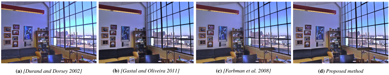
Figure 3: HDR Tone Mapping. (a) Result with the bilateral filter. (b) Result using the domain transform approach. (c) Result using WLS [Farbman et al. 2008]. (d) Our result for 1 iteration with \lambda = 0.006 , \gamma = 40 and \alpha = 2 using f_2 ;