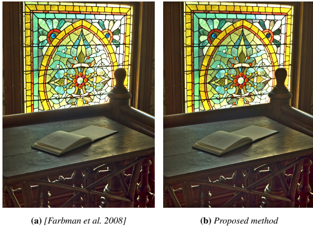
Figure 4: Multi-layer HDR Tone Mapping. (a) Result with WLS. (b) Proposed method.