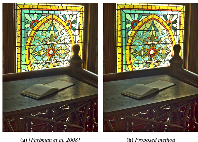
Figure 4: Multi-layer HDR Tone Mapping. (a) Result with WLS. (b) Proposed method. (HDR image © Industrial Light & Magic. All rights reserved.)