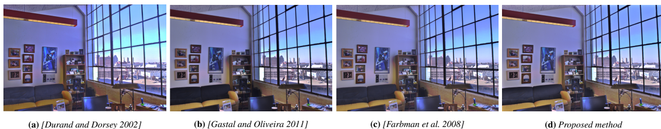
Figure 3: HDR Tone Mapping. (a) Result with the bilateral filter. (b) Result using the domain transform approach. (c) Result using WLS [Farbman et al. 2008]. (d) Our result for 1 iteration with \lambda = 0.006 , \gamma = 40 and \alpha = 2 using f_2 ;