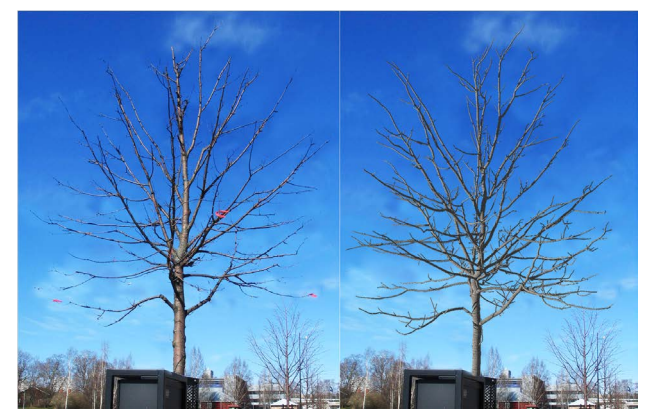
Fig. 1. Example of a lime tree reconstruction with the method of Preuksakarn et al. (2010). Left: an original picture of the tree. Right: the reconstructed virtual model inserted into same background.

While these methods produce realistic structures as shown by Fig. 1, no method to compare them quantitatively or evaluate their respective accuracy has been proposed so far. Such evaluation is of major importance for further exploitation of reconstructed models in biological applications. In this work, we address the problem of evaluating the accuracy of reconstructed structures from laser scanner data. For this, we first present a software tool that allows experts to define reconstruction from the point cloud. Using these expert-defined structures that will be considered as reference, we then propose different indices and algorithmic methods to quantify the similarities and differences between automatically reconstructed and reference structures. Such indices make it possible to compare the reconstructions made with the different methods proposed in the literature.