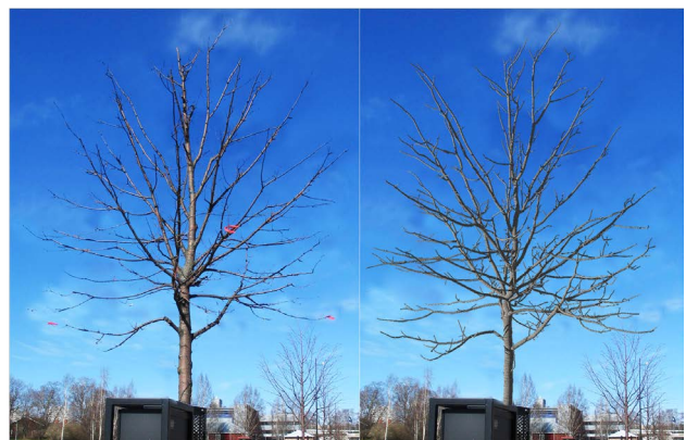
Fig. 1. Example of a lime tree reconstruction with the method of Preuksakarn et al. (2010). Left: an original picture of the tree. Right: the reconstructed virtual model inserted into same background.

While these methods produce realistic structures as shown by Fig. 1, no method to compare them quantitatively or evaluate their respective accuracy has been proposed so far. Such evaluation is of major importance for further exploitation of reconstructed models in biological applications. In this work, we address the problem of evaluating the accuracy of reconstructed structures from laser scanner data. For this, we first present a software tool that allows experts to define reconstruction from the point cloud. Using these expert-defined structures that will be considered as reference, we then propose different indices and algorithmic methods to quantify the similarities and differences between automatically reconstructed and reference structures. Such indices make it possible to compare the reconstructions made with the different methods proposed in the literature.