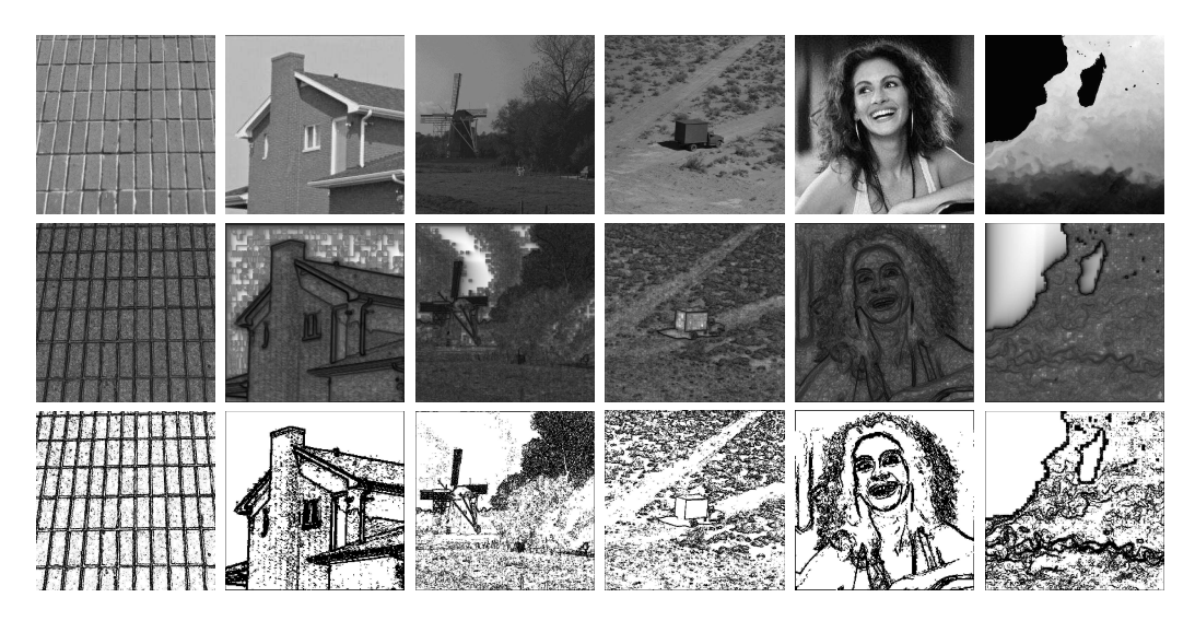
Figure 2: Images used for experiment 1. Top row (from left to right): Brick wall (SIPI image database), House (SIPI image database), imk03322 (van Hateren image database), Aerial view of a truck (SIPI image database), Julia Roberts (internet download), Sea Surface Temperature (SST) image of the Agulhas current below the coast of South Africa (SST data acquired by MODIS satellite on August 2, 2007). Middle row: visualisation of the singularity exponents. Bottom row: compact representation of MSM points corresponding to 30 % pixel density.

repeated over the images by adding different proportions of Gaussian white noise with respect to the standard deviation of the input images (results are shown in table 3).