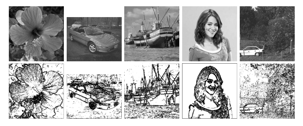
Figure 3: Images used for experiment 2. Row 1 (from left to right): Hibiscus (SIPI image database), Car (CMU image database), Boat (SIPI image database), Camille (internet download), imk03324 (van Hateren image database). Row 2: MSM points corresponding to 30% pixel density.