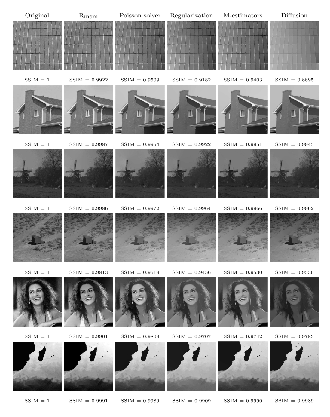
Table 1: Performance of different reconstruction algorithms (Experiment 1). Row 1: Brick wall Row 2: House Row 3: imk03322 Row 4: Aerial view of a truck Row 5: Julia Roberts Row 6: SST image.