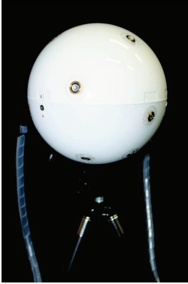
Fig. 1. The fabricated 12-element spherical microphone array.

Eliminating the nuisance parameter \Phi_{vv}(\tau, \omega) as in the first method, we obtain the following algorithm: