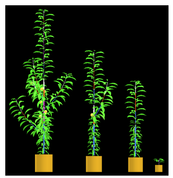
Fig. 2. Reduction in growth and lateral branching along a peach tree trunk depending on the carbon threshold required to build successive zones. The tree on the left is the normal case (all zones are developed). In the right most tree, the carbon thresholds for each zone were twice those of tree on the left. The simulated time span is for 1.5 years.