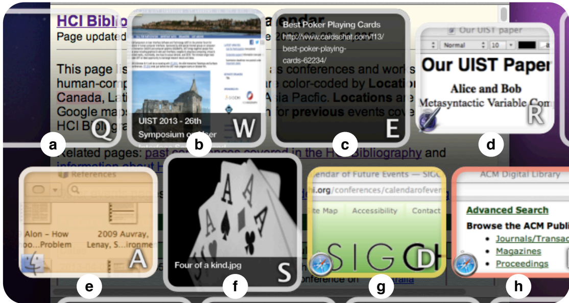
Figure 3: Closeup on the top left keys of the Hotkey Palette above the active window: (a) empty key; (b) document preview; (c) document title when the preview is not available; (d) window preview; (e) yellowed preview of a closed window; (f) grayed preview of a deleted document; (g) contextual shortcut associated to the active window (yellow border); (h) contextual shortcut associated to an ancestor of the document shown in the active window.

shortcuts to a particular web session. Hierarchical specialization works in this case because web URLs have paths.