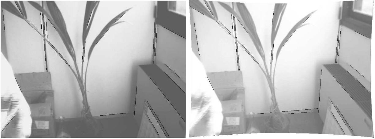
Figure 2: A distorted image with the detected segments (left) and the same image at the end of the distortion calibration with segments extracted from undistorted edges (right): some outliers were removed and longer segments are detected.