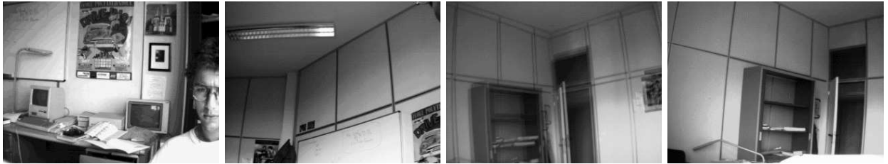
Figure 1: Some of the images that were used for distortion calibration.

The distortion calibration method was applied to sets of about 30 images (see Figure 1) for each camera/lens combination, and the results for the four parameters of distortion are shown in Table 1. The initial values for the distortion parameters before the optimization were set to “reasonable” values, i.e. the center of distortion was set to the center of the image, \kappa_1 was set to zero, and s_x to the image aspect ratio, computed for the camera specifications. For the IndyCam, this gave c_x = c_y = \frac{1}{2} , \kappa_1 = 0 and s_x = \frac{3}{4} .