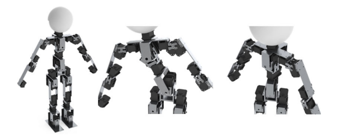
Fig. 1. Acroban Global Structure

2-revolute joints link. We essentially focused on designing a mechanically rich and open structure in the area of the vertebral column and the pelvis, providing it with 11 degrees of freedom.