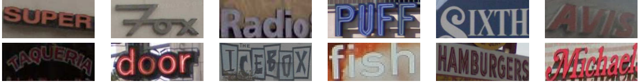
Figure 2: Scene text often contains examples that have a large variety of appearances. Here we show a few sample images from the SVT [30] and ICDAR [1] datasets, with issues such as, very different fonts, shadows, low resolution, occlusions. These images are much more complex than the ones seen in typical OCR datasets. Standard off-the-shelf OCRs perform very poorly on these datasets [23, 29].

26, 29, 30, 31]. Chen and Yuille [6] and later, Epshtein et al. [11] have addressed the problem of detecting text in natural scenes. These two methods achieve significant detection results, but rely on an off-the-shelf OCR for subsequent recognition. Thus, they are not directly applicable for the challenging datasets we consider. De Campos et al. [9] proposed a method for recognizing cropped scene text characters. Although character recognition forms an essential component of text understanding, extending this framework to recognize words is not trivial. Weinman et al. [31] and Smith et al. [26] showed impressive scene text recognition results using similarity constraints and language statistics, but on a simpler dataset. It consists of “roughly fronto-parallel” pictures of signs [31], which are quite similar to those found in a traditional OCR setting. In contrast, we show results on a more challenging street view dataset [29], where the words vary in appearance significantly. Furthermore, we evaluate our approach on over 1000 words compared to 215 words in [26, 31].