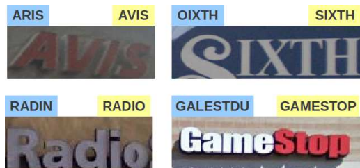
Figure 6: Bi-gram vs node-specific prior. The word inferred using bi-gram prior is shown on the left (in the blue box) and that inferred using node-specific prior is shown on the right (in the yellow box) at the top of every image. The node-specific prior shows a better performance over the bi-gram prior as it captures relative occurrence of characters more effectively. (Best viewed in colour.)

Discussion. Our method is inspired by the work of [29] and [10], but we differ from them in many aspects as detailed below. The method of [29] is a strongly top-down approach, where each word in the lexicon is matched to a given set of character windows, and the one with the lowest score is the predicted word. This is prone to errors when characters are missed or detected with low scores. In contrast, we build a model from the entire lexicon (top-down cues), combine it with all the character detections (bottom-up cues), which have low or high scores, and infer the word with a joint inference scheme. This model, which uses both top-down and bottom-up cues, provides us with a significant improvement in accuracy. Furthermore, unlike the trie based structure for storing lexicon in [29], our method is not restricted by the size of the lexicon.