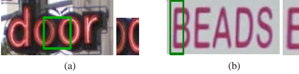
Figure 3: Typical challenges in multi-class character detection. (a) Inter-character confusion: A window containing parts of the two o’s is falsely detected as x. (b) Intra-character confusion: A window containing a part of the character B is recognized as E.

classes in \mathcal{K} . In our implementation, we used Histogram of Gradient (HOG) features [8] for \phi_i , and the likelihoods p(\cdot) were learnt using a multi-class Support Vector Machine (SVM) [5]. Details of the training procedure are provided in Section 4.2.