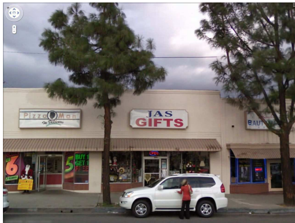
Figure 1: A typical street scene image taken from Google Street View [29]. It contains very prominent sign boards (with text) on the building and its windows. It also contains objects such as car, person, tree, and regions such as road, sky. Many scene understanding methods recognize these objects and regions in the image successfully, but tend to ignore the text on the sign board, which contains rich, useful information. Our goal is to fill-in this gap in understanding the scene.

The problem of understanding scenes semantically has been one of the challenging goals in computer vision for many decades. It has gained considerable attention over the past few years, in particular, in the context of street scenes [3, 20]. This problem has manifested itself in various forms, namely, object detection [10, 13], object recognition and segmentation [22, 25]. There have also been significant attempts at addressing all these tasks jointly [14, 16, 20]. Although these approaches interpret most of the scene successfully, regions containing text tend to be ignored. As an example, consider an image of a typical street scene taken from Google Street View in Figure 1. One of the first things we notice in this scene is the sign board and the text it contains. However, popular recognition methods ignore the text, and identify other objects such as car, person, tree, regions such as road, sky. The importance of text in images is also highlighted in the experimental study conducted by Judd et al. [17]. They found that viewers fixate on text when