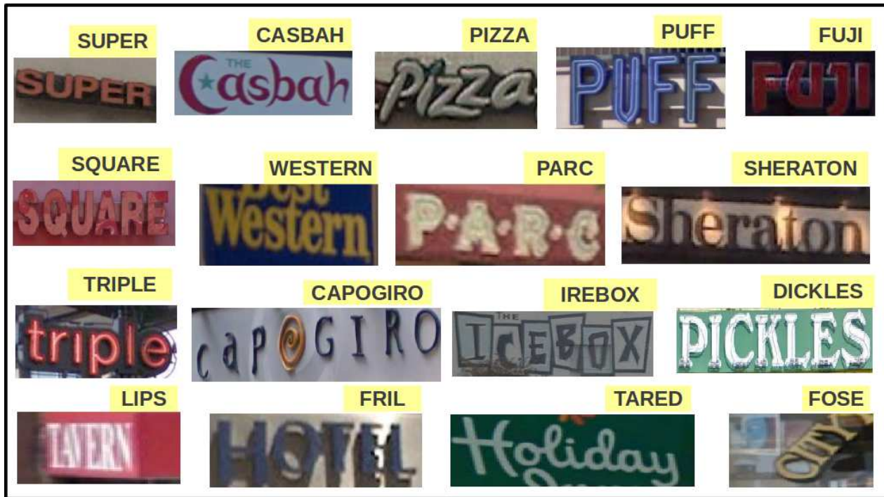
Figure 7: Example word recognition results on challenging images from the SVT dataset [29] using the node-specific lexicon prior. Our method handles many different fonts, distortions (e.g. CAPOGIRO in row 3). There are few failure cases however, as shown in the bottom row. We found the main causes of such failures to be: (i) weak unary term; and (ii) missing characters in the detection stage itself (see Figure 5). Some of these issues (e.g. CITY image in the bottom row) can be addressed by modifying the sliding window procedure.