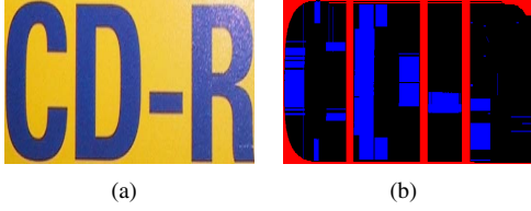
Figure 2. (a) Input Image (b) Its foreground-background seeds, Red and blue colour shows foreground and background seeds respectively (Best viewed in colour).