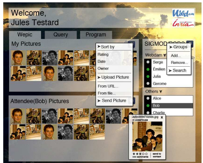
Figure 1: A screenshot of the Wepic user interface.

We now illustrate how some of these units of functionality are implemented with WebdamLog rules. To view pictures uploaded by a particular SIGMOD attendee, we use a relation selectedAttendees that contains one fact for each currently highlighted attendee (see right-hand side column in Figure 1). We also use a derived relation pictures , which is the view of all the pictures of a particular attendee. To obtain the pictures of all selected attendees, we use the rule: