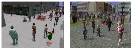
Figure 2: Results from Yersin's method

In this section we describe two different approach to create crowd patches.