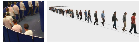
Figure 3: A result from Li's method. Left: A snapshot of motion capture session, where pedestrians followed each other. Right: Periodicity is found in motion capture's data and then transformed into connectable patches.

In the second method, described in [LCS*12], instead of generating trajectories, we use existing data (motion capture or simulation data as shown in Figure 3). We search for portions of data which satisfy two rules. Firstly data have to be as periodic as possible. Secondly the spatiotemporal conditions in the data limit have to match with other patches