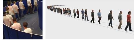
Figure 3: A result from Li's method. Left: A snapshot of motion capture session, where pedestrians followed each other. Right: Periodicity is found in motion capture's data and then transformed into connectable patches.

In the second method, described in [LCS*12], instead of generating trajectories, we use existing data (motion capture or simulation data as shown in Figure 3). We search for portions of data which satisfy two rules. Firstly data have to be as periodic as possible. Secondly the spatiotemporal conditions in the data limit have to match with other patches