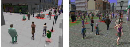
Figure 2: Results from Yersin's method

In this section we describe two different approaches to create crowd patches.