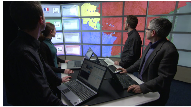
Fig. 3. VA on a Wall-Sized Display, link to http://www.youtube.com/watch?v=5i3xbitEVfs

To comply with these requirements, information visualization systems typically rely on ad-hoc in-memory databases to hold the active data, and use a column-oriented architecture for performance reasons. It is interesting to note that, with a few exceptions, the existing implementations are not based on standard databases—the research fields of databases and visualization still need to join their efforts [4], [5]. This situation must change, since managing larger amounts of data will require faster and more sophisticated databases, which are too complex for non-specialists to implement. Conversely, existing databases will need extensions to manage the visualization data structures which are likely to become a standard functionality provided by database