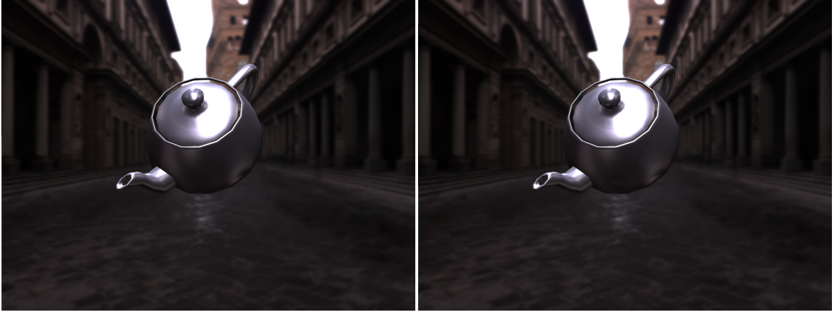
Figure 1: Comparisons of rendered images with ( Left ) the weight \beta_i and without ( Right ) where discontinuities are introduced. The cube map size is 512 \times 512 \times 6 .