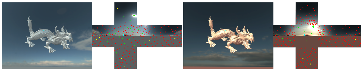
Figure 1: Time-varying light samples distribution for one pixel (cyan dot) on the dragon model when lit with a dynamic environment map [STJ*04]. In the cube map images, the cyan dot corresponds to the normal direction. For each frame, among on-the-fly generated samples (red+yellow+green) on the whole environment map, our technique selects 50 of them (yellow and green dots). The green dots correspond to effective samples where the cosine factor is strictly positive. At nearly noon ( Left ), our technique selects less samples on the sun than at sunset ( Right ), since it is located at a more grazing angle. This example runs in average at 145 fps using Multiple Importance Sampling with 50 samples for the Lafortune energy conserving Phong BRDF with a shininess exponent set to 150.

1. Inria Bordeaux Sud-Ouest - LP2N (Univ. Bordeaux, IOGS, CNRS) - LaBRI (Univ. Bordeaux, CNRS)