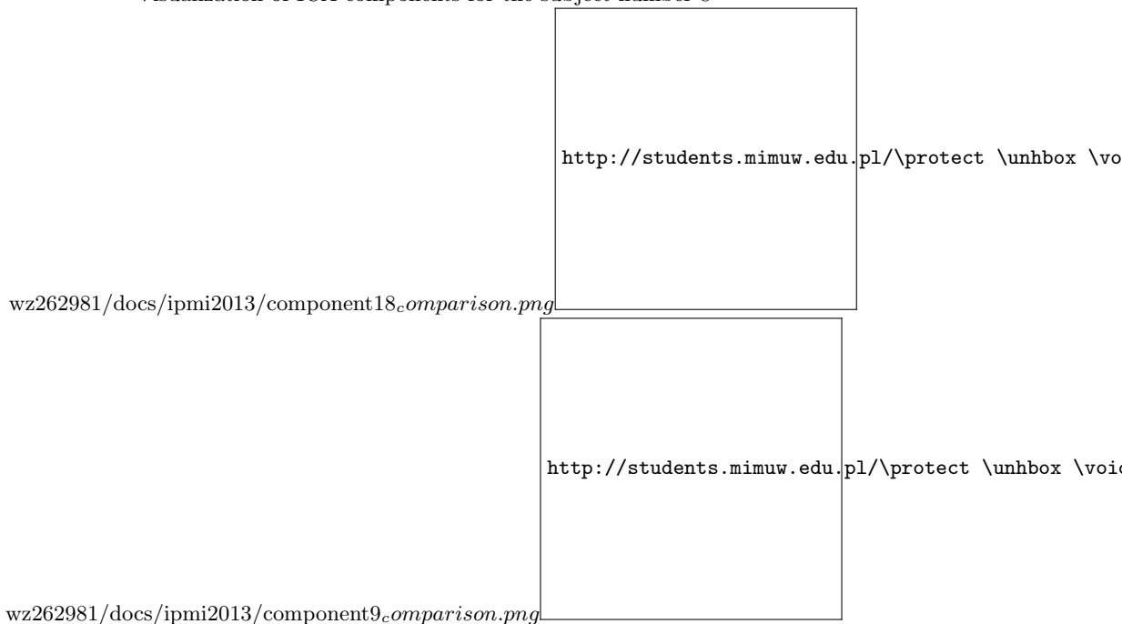
Fig. 4: Visualization of two ICA components with various alignment techniques. The figure presents the absolute value of the difference between the target class means. A difference between samples corresponding to the first outcome of a mental state and the second outcome (in this case mean of samples of green color recall minus mean of samples of red color recall). Red on this figure indicates regions that discriminate between classes. All methods make use of the same color palette to facilitate the comparison between subfigures.

been applied. The relatively small standard deviation indicates that the H^1 norm is very stable in our setting.