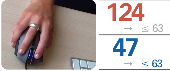
Figure 2: Physical layout (left) and display for failed (top-right) and successful (bottom-right) trials.

completion, a message indicating whether the trial was successful or not was displayed for 750 ms, after which the instructions for the next trial were automatically presented.