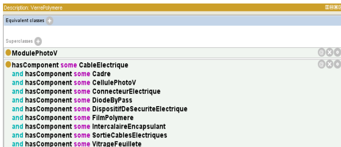
Figure 1: Example of a defined concept

As a result, our ontology of technical document called OntoDT has 121 classes and 39 properties formalized in the OWL Lite language. 35% of these classes are created from REEF terms. The remaining 65% are concepts more specific than those of the REEF thesaurus which only contains general concepts of the building industry. In its current state, it lacks specific terms relative to a particular field (e.g. Photovoltaic). However, it remains in constant evolution.