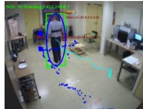
Figure 3. RGB cam. view

indicate the best of the ten test sets during the cross-validation. Figure 3 (Detection view of RGB camera) shows a “standing” detection example of the RGB camera which is fixed at a corner of the experimental room, and Figure 4 shows the detection view of the RGB-D camera at the same time instant.