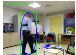
Figure 4. RGB-D cam. view