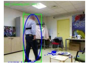
Figure 4. RGB-D cam. view