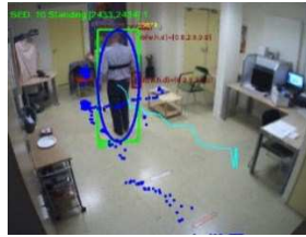
Figure 3. RGB cam. view

indicate the best of the ten test sets during the cross-validation. Figure 3 (Detection view of RGB camera) shows a “standing” detection example of the RGB camera which is fixed at a corner of the experimental room, and Figure 4 shows the detection view of the RGB-D camera at the same time instant.