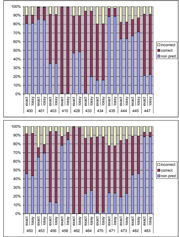
Figure 5: Simulation of a C/DC address predictor. Percentage of non-predicted, correctly predicted and mispredicted addresses for the exact traces and for the lossy-compressed ones.

The experimental set-up is the same as described in Section 4.2. Each exact trace contains 1 billion addresses that were compressed with bytesort. Approximate traces are generated from the exact traces. Then we use exact and approximate traces to simulate a set of cache configurations, and we compare the cache miss ratios. We used the Cheetah cache simulator [30] to simulate a set-associative cache, varying the number of cache sets and the associativity. Table 3 gives the bits per address for lossy vs. lossless compression. The interval