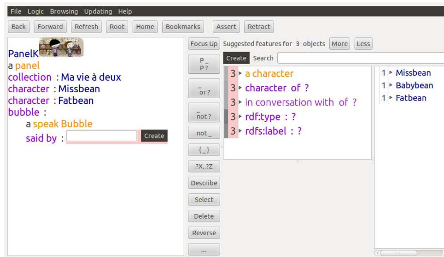
Fig. 2. Screenshot of Sewelis. On the left side, the description of new object is shown, here the panel K is a panel from the Ma vie à deux Collection, with Missbean and Fatbean as characters, it has a speech bubble said by someone. On the right side, suggested resources for the focus are listed, here the speakers.