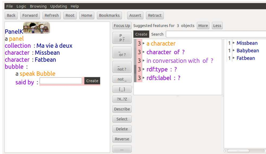
Fig. 2. Screenshot of Sewelis. On the left side, the description of new object is shown, here the panel K is a panel from the Ma vie à deux Collection, with Missbean and Fatbean as characters, it has a speech bubble said by someone. On the right side, suggested resources for the focus are listed, here the speakers.